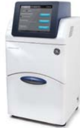
ImageQuant LAS 500

The ImageQuant LAS systems are flexible systems that cover a wide range of imaging applications. These CCD based imagers provide an affordable option for protein detection with genuine benefits, including quantitation with high sensitivity, publication grade data, and image and data archiving.